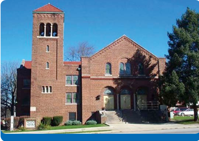
United Methodist Church of Attica - $1,195 for annual payout from endowment fund