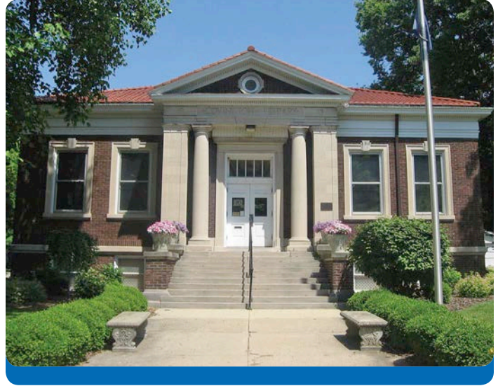
Covington-Veegersburg Library - $1,611 payout from the endowment fund

Attica School Corporation - $4,000 for a new pool timing system to benefit the Attica Swim Team