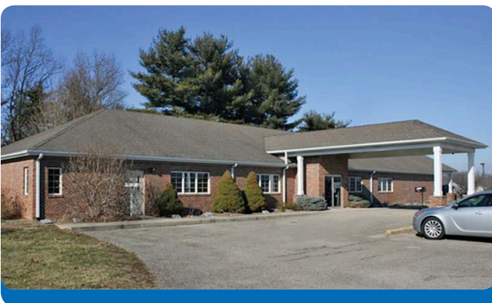
Covington Community Center (formerly named Friendship Circle Center) - $6,800 for annual operating support and equipment upgrades

Every 15 Minutes Program - Attica Jr./Sr. High School - $2,500 for an event designed to dramatically instill teenagers with the potentially dangerous consequences of drinking alcohol and texting while driving. The program challenges students to think about drinking/texting while driving, personal safety, and the responsibility of making mature decisions when lives are involved.