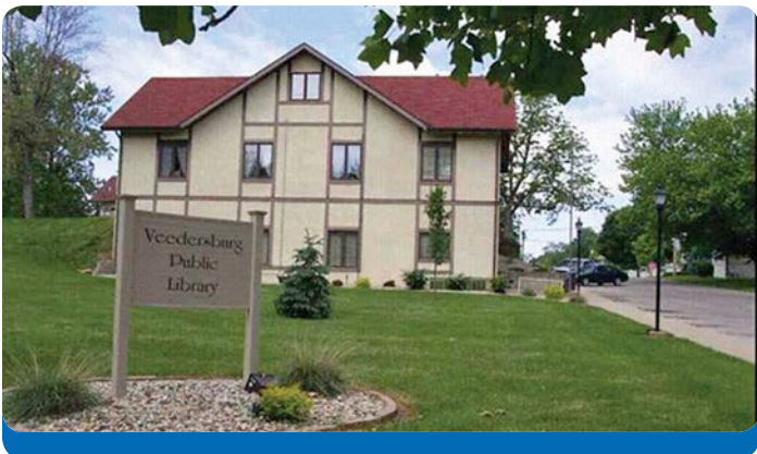
Veedersburg Friends of the Library - $1,342 for annual payout from the endowment fund

Southeast Fountain Elementary School - $1,500 for the purchase of ukuleles to be used in the Music Program